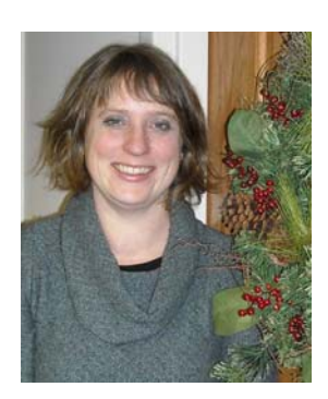
May the Peace of Christ dwell richly within you and yours this season!

¡Que la paz de Cristo more ricamente en usted y los suyos durante esta temporada!