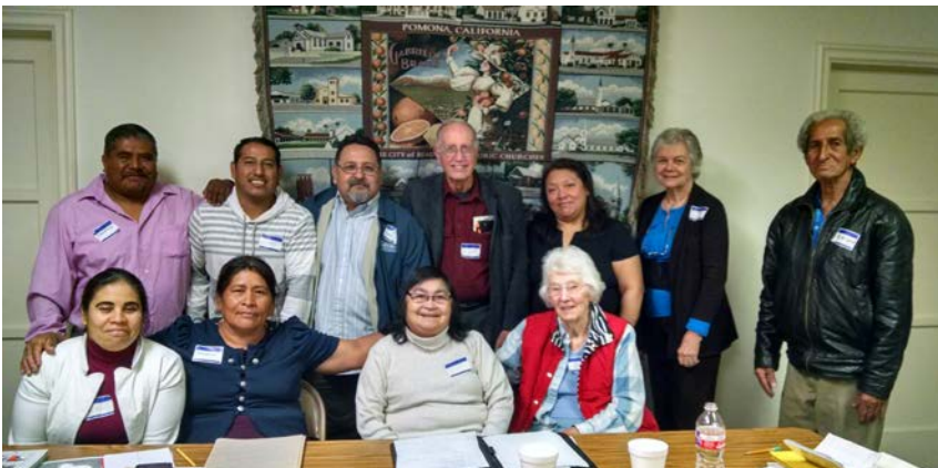
de pastores y laicos de Cristo Sion, mas algunos voluntarios del distrito

Este año como parte de satisfacer los requisitos del programa para la asistencia a una conferencia anual, tres estudiantes de SeBAH-CoB estarán en Grand Rapids.