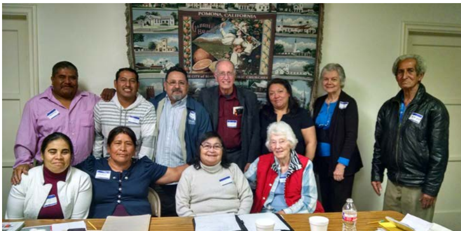
of Cristo Sion pastors, laity, and district volunteers

This year as part of satisfying the program requirements for attendance at Annual Conference, three SeBAH-CoB students were present in Grand Rapids.