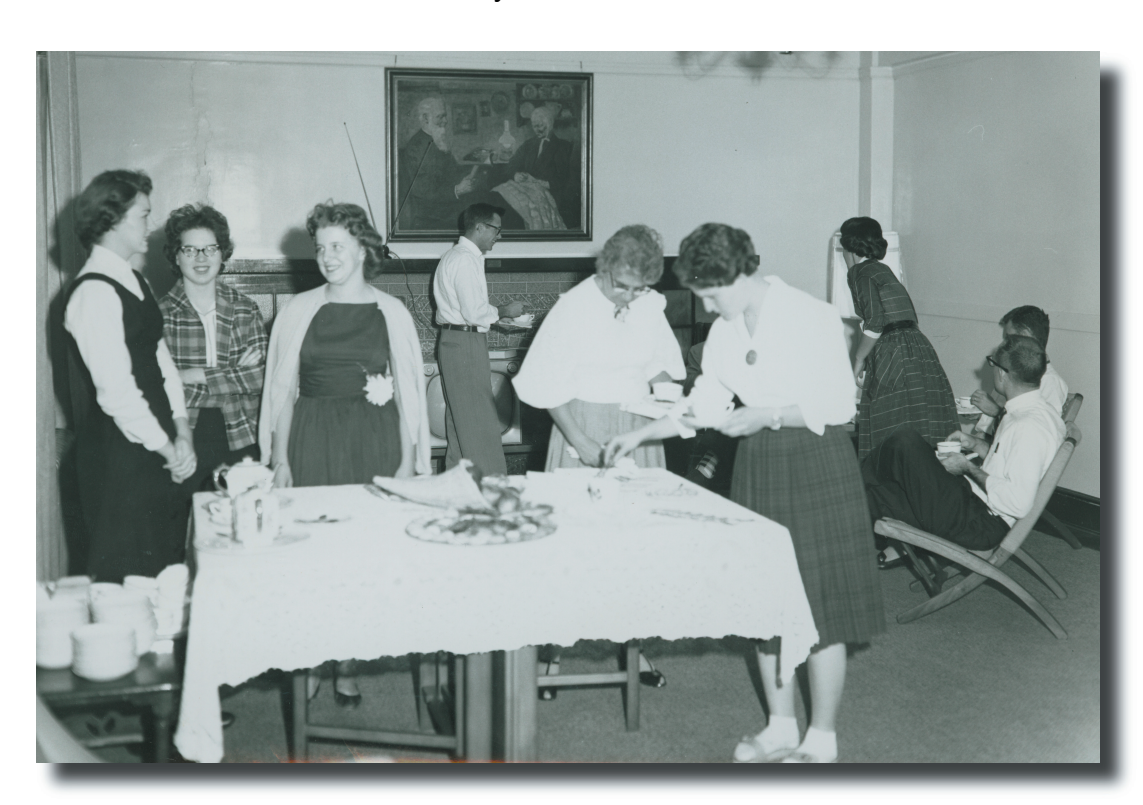
Social gathering at the Van Buren Street campus.