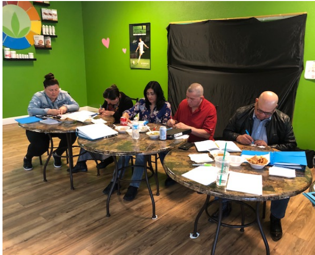
Grupo de los Baños Los Baños group